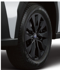
18" Alloy Wheel Size: 18x7.0J Tire Size: 225/60 R18