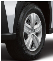
17" Steel with Wheel Cover (Wheel covers as shown are sold separately) Wheel Size: 17x7.0J Tire Size: 225/65 R17