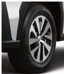
17" Alloy Wheel Size: 17x7.0J Tire Size: 225/65 R17