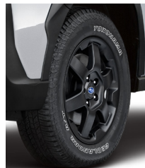
17" Alloy Wheel Size: 17x7.0J Tire Size: 225/65 R17