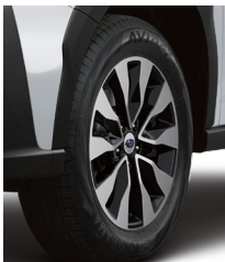
18" Alloy Wheel Size: 18x7.0J Tire Size: 225/60 R18